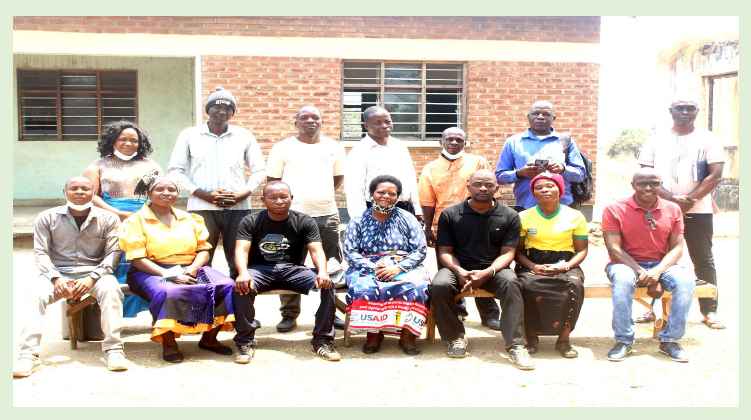
Ndindi ADC members with MEJN and IM officials